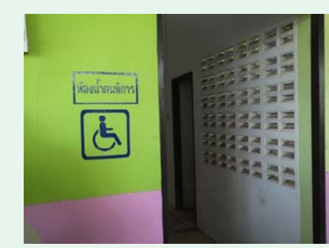
Toilet and sloping path in Kanchanaburi Province