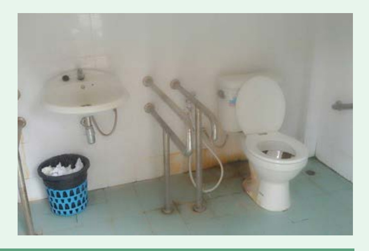
Parking, toilet and sloping path in Nakon Si Thammarat Province