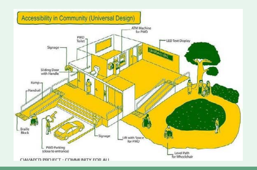
Community for All Universal design

These achievements represent the engagement of local authorities and other stakeholders in promoting the fulfillment of the rights of persons with disabilities, and all of them were realized through local public budget.