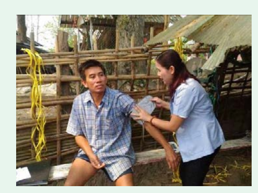
operations specialist shared with the interviewer about "Thawangthong rehabilitation center and home visit for persons with disabilities"