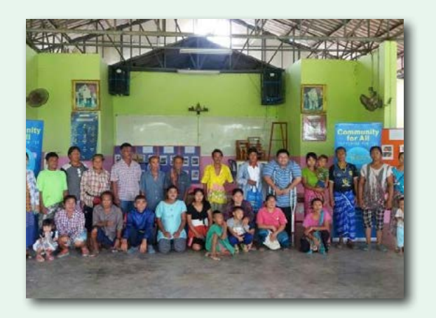
Photo: operations specialist shared with the interviewer about "Groups of people with disabilities";