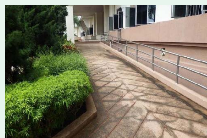
Toilet and sloping path in Payao Province