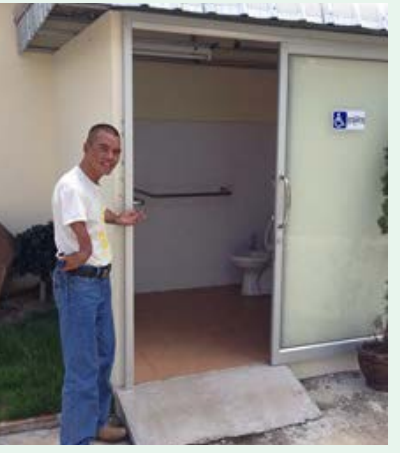
Toilet and sloping path in Si Ssa Ket Province